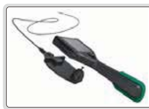
changeable lens cable