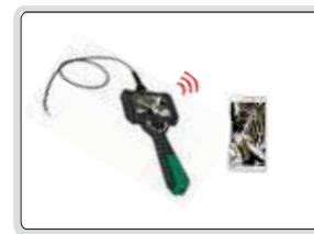
WIFI real-time image transmission